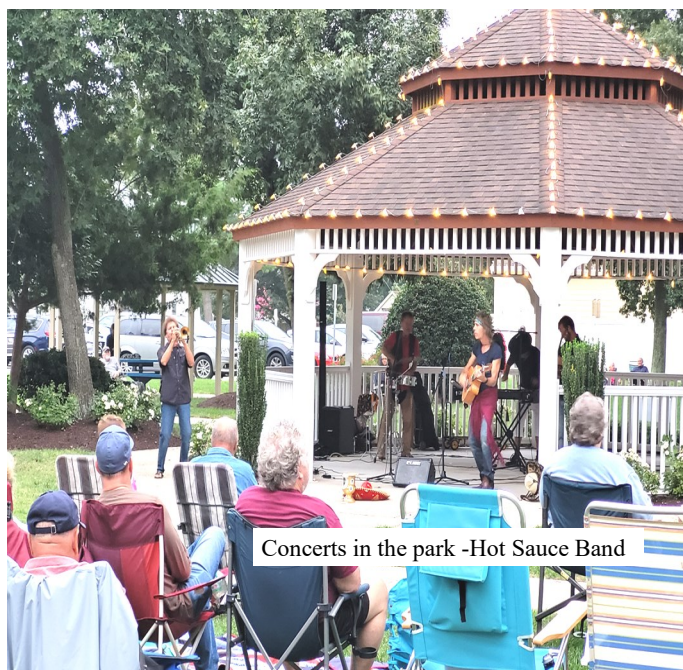
Concerts in the park -Hot Sauce Band