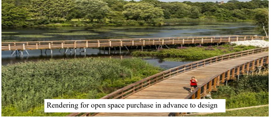
Rendering for open space purchase in advance to design