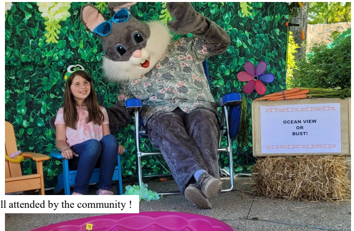
Well attended by the community !