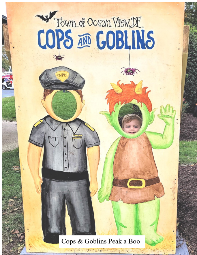
Cops & Goblins Peak a Boo