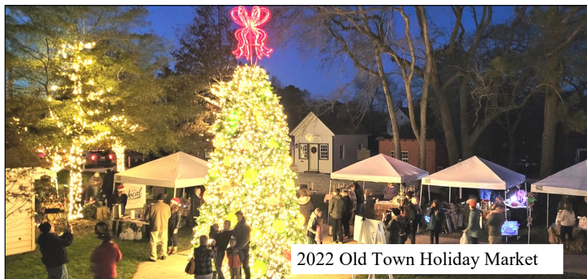
2022 Old Town Holiday Market

Seasons of Family Fun at Beautiful John West Park! (32 West Ave)