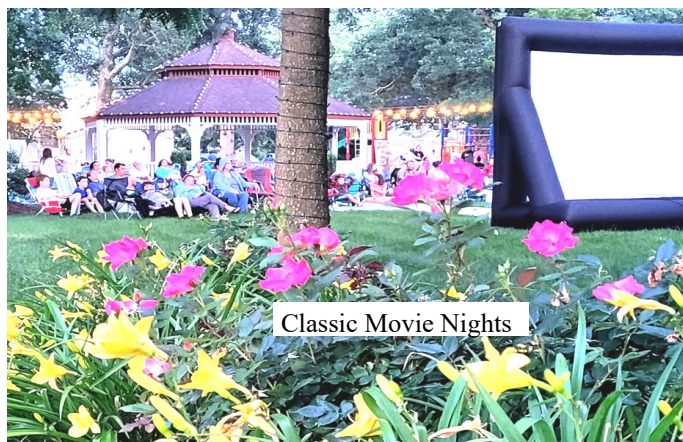
Classic Movie Nights